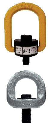
Rotating eye bolt